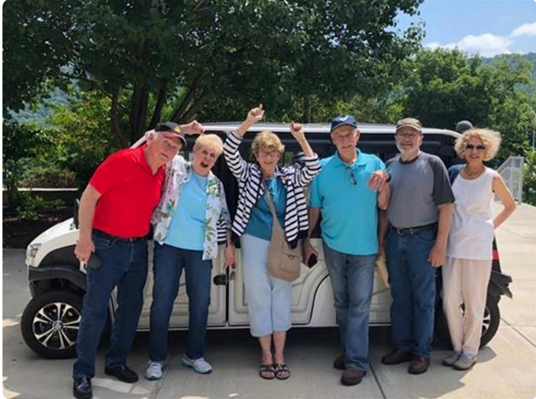
"Our 2019 Vacation"